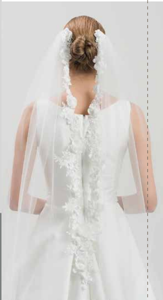
3 DIMENSIONAL VEILS