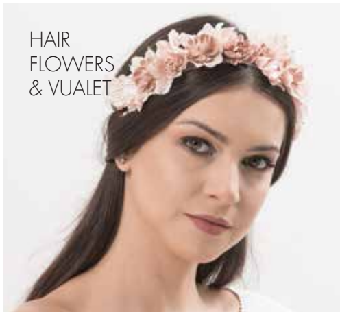
HAIR FLOWERS & VUALET