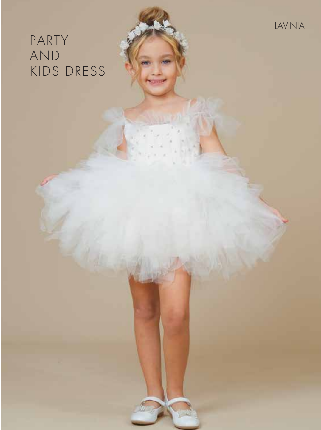
PARTY AND KIDS DRESS