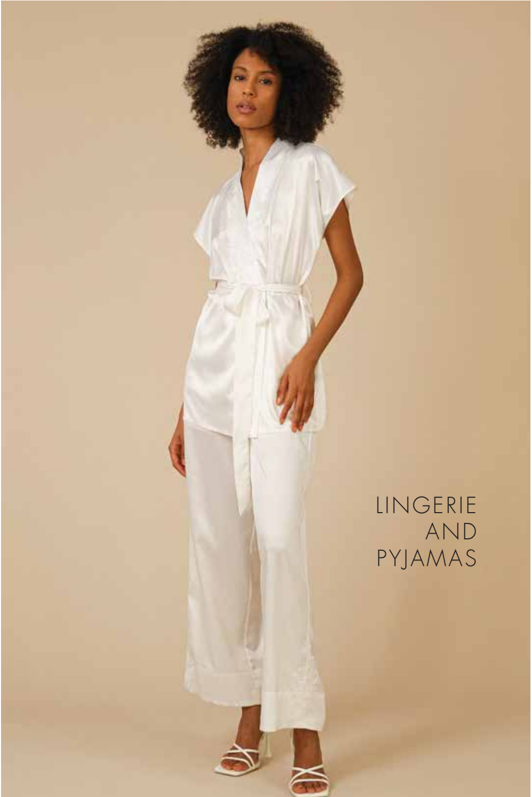
LINGERIE AND PYJAMAS